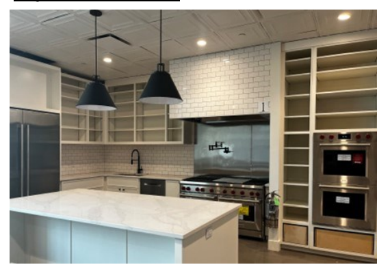
Magnolia HQ Coffee Bar